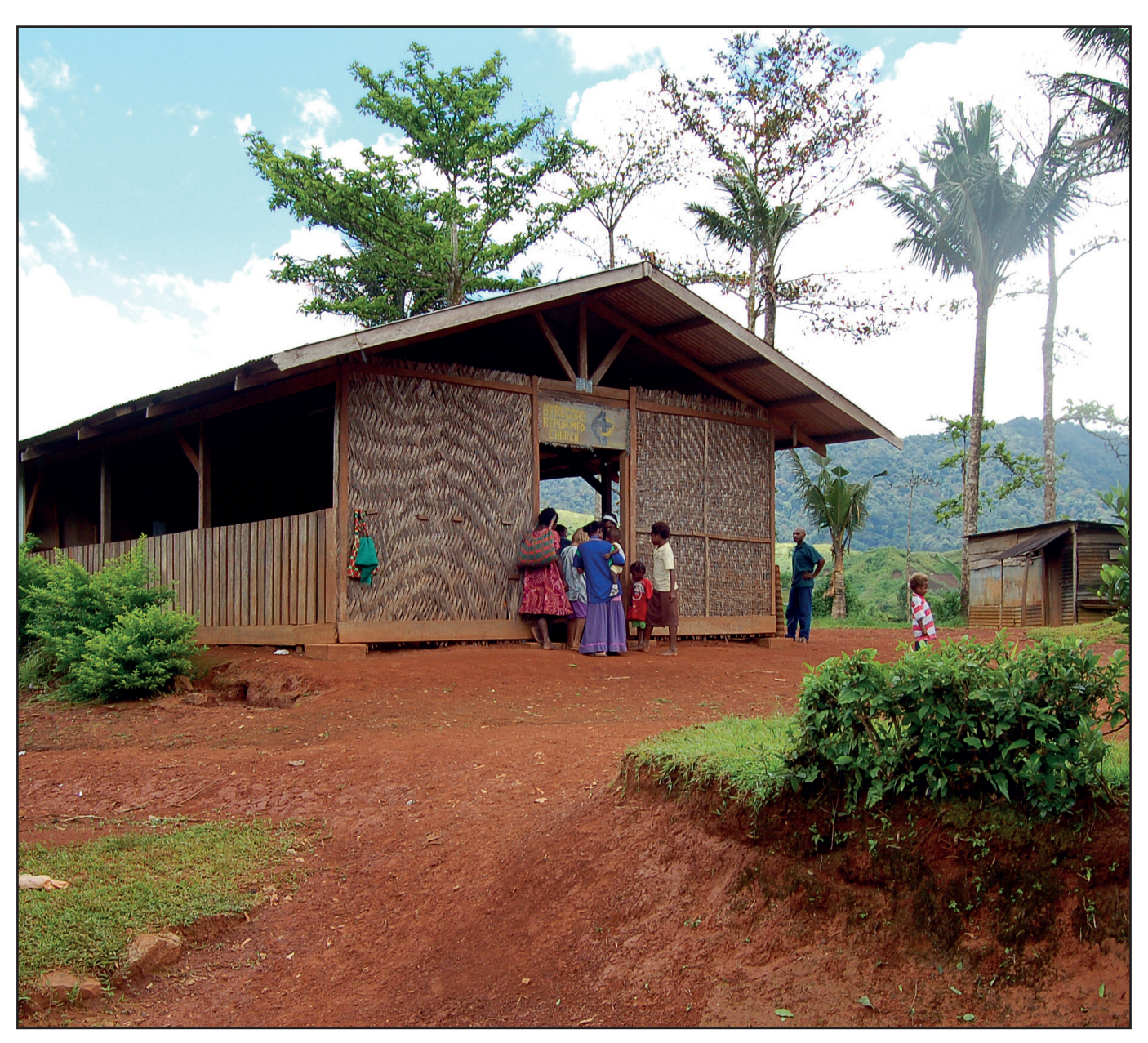
Beregoro Reformed Church

The Reformed Churches Bible College Sogeri Road, 14 Mile, Central Province Postal Address: P.O. Box 590 Waigini, NCD, PNG