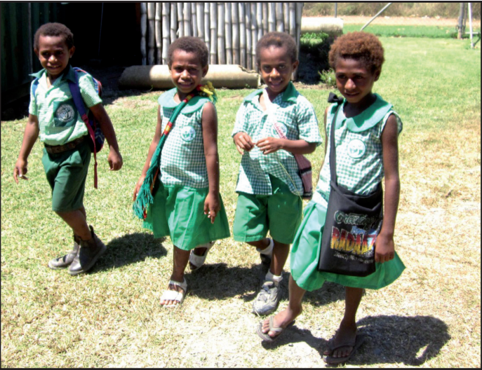
Tulait, Volume 2 Number 2, August 2012 – Page 9

This year there are quite a few children heading off to school every morning! Here are the prep and elementary students.