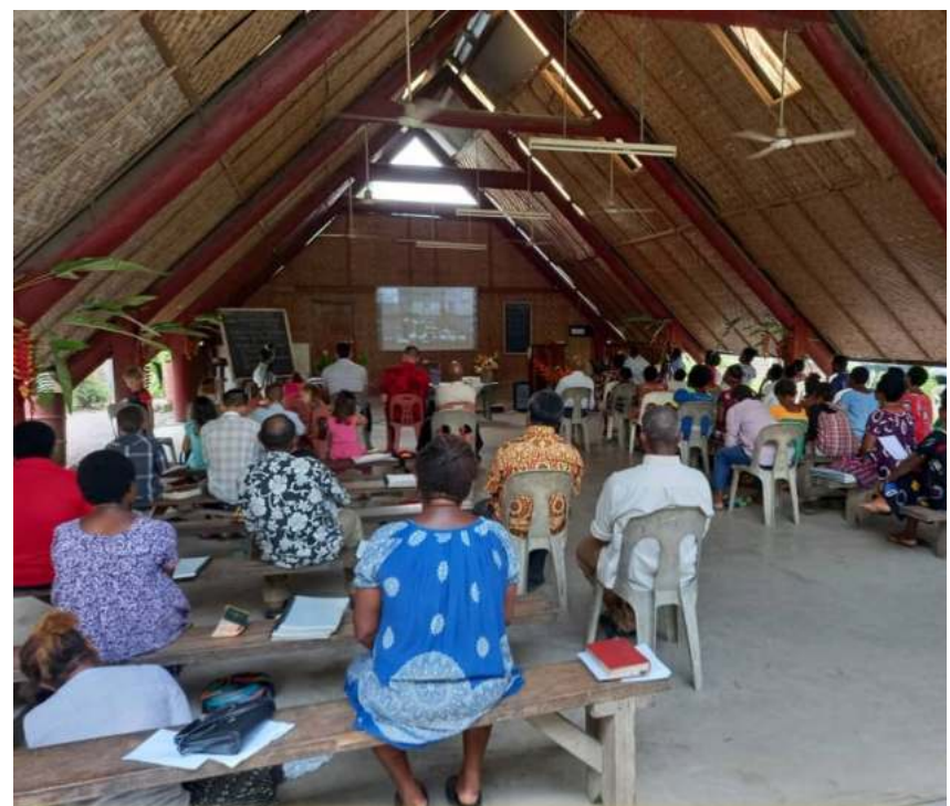
Installation Service in PNG