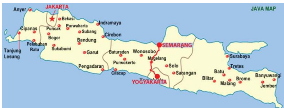
Map of Central Java. Dampit is located on Mt Bromo near Malang