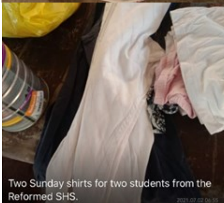
Two Sunday shirts for two students from the Reformed SHS.